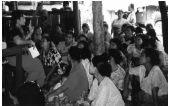
Women at the Maela camp at the Thai-Burma border learn about family planning. Information about contraceptive options, STDs, and other reproductive health issues enables women to practice healthy behaviors and reduce risks.

Refugees also may return to find that the health care system has been physically destroyed, with facilities damaged, supplies stolen, and records scattered. During the war in Bosnia, for example, 40 percent of the health care infrastructure was destroyed and more than 12,000 health care professionals were killed or fled. 11 When 650,000 refugees streamed home to Brazzaville after five months of civil war in Congo, the International Rescue Committee used MISP kits from UNFPA to begin restocking hospitals and clinics, restoring basic