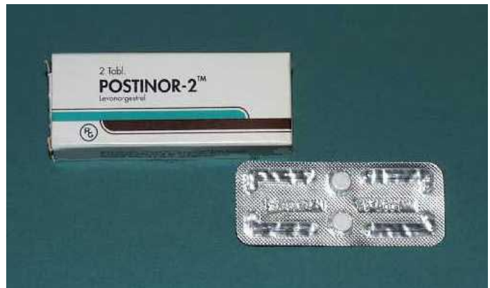
Postinor-2™, the first available levonorgestrel-only ECP product, is being introduced in Kenya, Sri Lanka, and several other countries.

The WHO study involved 1,998 women at 21 centers worldwide and found that levonorgestrel-only ECPs have fewer side effects and are more effective than combined ECPs (see Table 1). 1 Overall, women taking the levonorgestrel regimen had only about one-third the risk of pregnancy compared to women taking a combined estrogen-progestin regimen (relative risk 0.36; 95% CI 0.18–0.70). The levonorgestrel-only regimen consists of 0.75 mg levonorgestrel taken within 72 hours of unprotected intercourse followed by another 0.75 mg dose 12 hours later. The combined emergency contraception regimen—also known as the Yuzpe regimen—consists of 100 mcg ethinyl estradiol plus 0.5 mg levonorgestrel (two “high-dose” oral contraceptive pills) taken within 72 hours of unprotected intercourse, followed by the same dose 12 hours later. The women were randomly assigned to a treatment regimen. The analysis excluded 43 women for whom the outcome of treatment was unknown. The WHO study also found that the effectiveness of both emergency contraception regimens declined with increasing time since